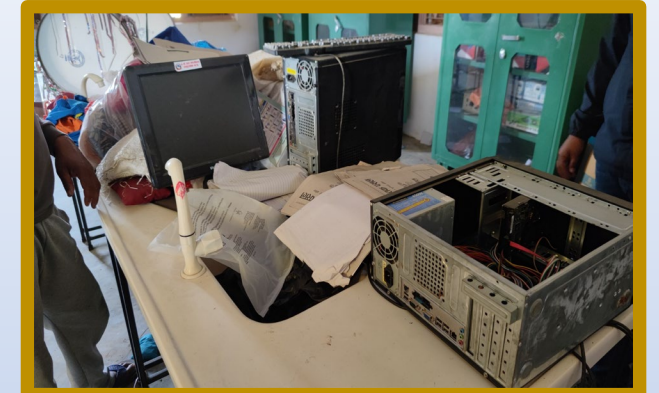
Existing Computer Lab Room (Two Broken Desktop)