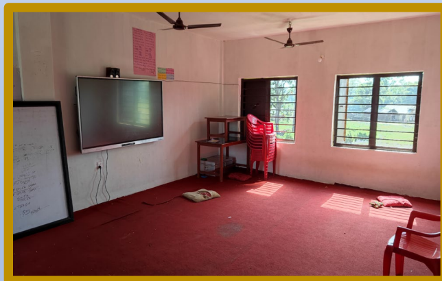
Proposed Computer Room 23 Feet Length x 15 Feet Width