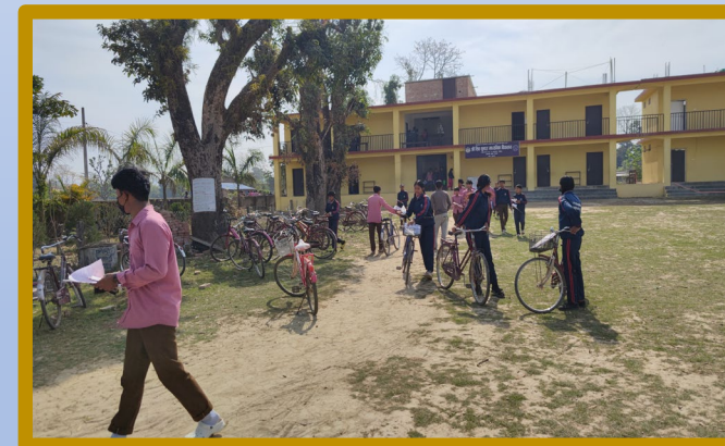
Students Appearing For Final Term Examination